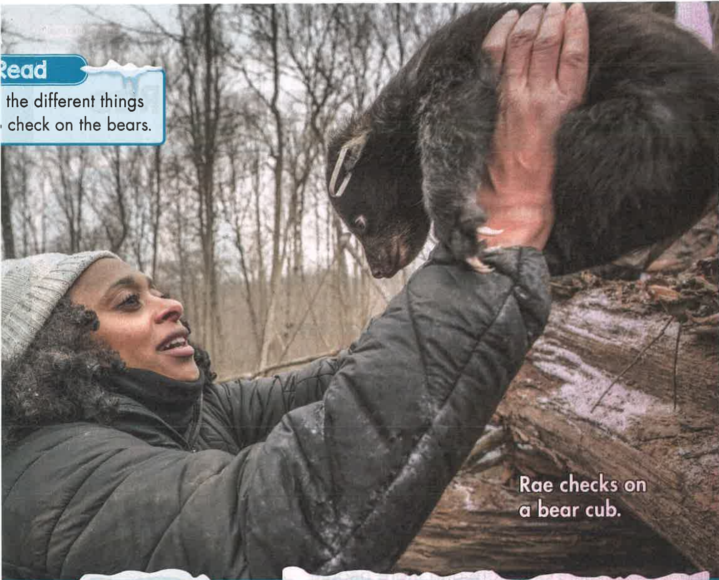
Rae checks on a bear cub.

the different things check on the bears.