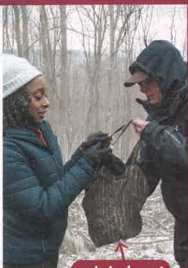
cub in here!

After that, she checks on the cubs. She measures them. She puts them in a bag to weigh them.